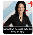
SUSANA A. MENDOZA CITY CLERK

Guide Legislation Meetings Legislative Bodies Council Members